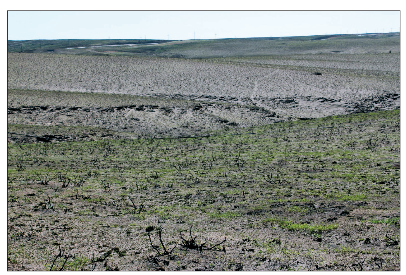
Figure 1. Early revegetation on sandy soil following a March 24, 2016, wildfire in Barber County, Kansas.

Wildfires, accidental fires, or escapes from prescribed burning, burn thousands of acres of Kansas rangeland each year. Unlike prescribed burning, wildfires are not conducted under specific conditions to accomplish defined objectives. Wildfires typically occur during the dormant season from late fall to midspring when vegetation and soil surfaces are dry, relative humidity is low, and wind velocity is above average.