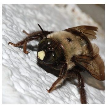
Figure 3: Male carpenter bee