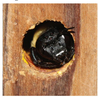
Figure 2: Female carpenter bee

Male carpenter bees are easily distinguished from females because they have a whitish or golden (some describe it as bald) face. Females have a dark or black shiny face (Figures 2 and 3). The distinction is important because females can sting, but males cannot.