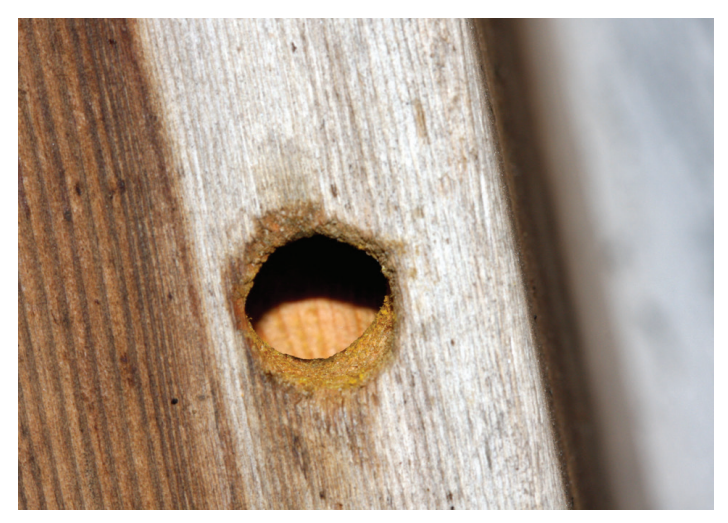
Figure 4: Carpenter bee tunnel entrance

After mating, females begin to construct nests by refurbishing old nest sites or excavating new sites. Carpenter bees' nests are relatively large, like the bees themselves. Excavation proceeds slowly, at the rate of about one inch per week in old, soft woods. The females chew through the wood, leaving ½ inch diameter tunnels that are smooth on the inside (Figure 4). They can chew through wood at right angles to the grain, but usually excavate the brood cells along the grain of the wood.