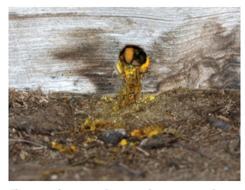
Figure 5: Carpenter bee tunnel entrance with sawdust and pollen trail

Prevention is the best tactic to manage carpenter bees. They prefer old, soft, untreated, and unpainted wood. Keep all exposed wooden surfaces well painted with a polyurethane or oil-based paint. Carpenter bees