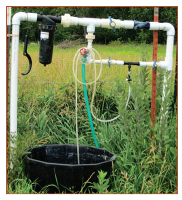
Figure 2 . A venturi-type injector introduces fertilizer into the irrigation water.