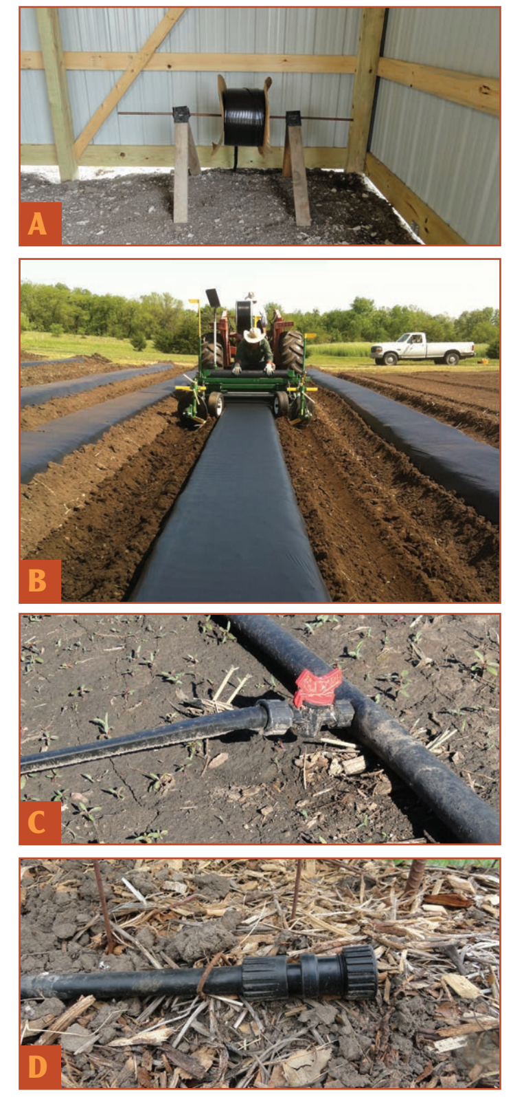
Figure 10. (A) A simple system for unrolling drip tape without kinks that can be used by a single installer. (B) A bed-shaper installs drip tape and plastic mulch. (C) Drip tape is connected to the header pipe with simple PVC connectors that have reverse-threaded locking collars(D). Drip tubing is terminated with a premanufactured cap.

Soil moisture should be monitored daily to maintain proper growing conditions. Several devices are available to aid in daily decision-making, but nothing beats personal experience with the crop and soil type. A tensiometer (Figure 13) is the most accurate for measuring soil moisture, but there are a number of good soil-moisture sensors. Tensiometers do not require power or batteries but need weekly maintenance and may not work as effectively in sandy soils. Water must be kept in the column inside the tube pumped weekly to prevent air bubbles from reducing accuracy. The tensiometer should be installed 4 to 8 inches below the ground and also at 12 to 15 inches below ground to gain a better understanding of soil moisture. A number of electric