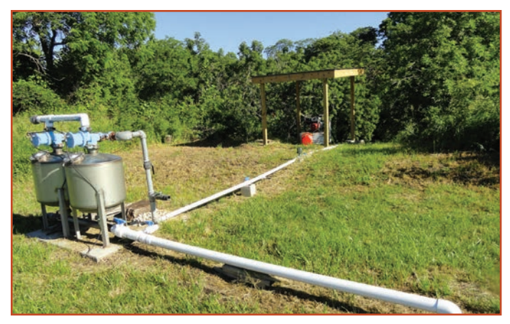
Figure 7. A sand filter (foreground) filters creek water delivered with a gas-powered pump (background).