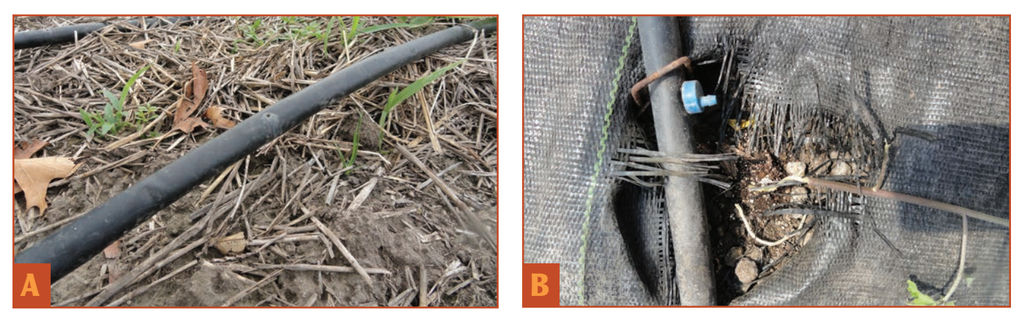
Figure 5. High-pressure drip system emitters can be (A) preinstalled at the factory or (B) installed during assembly.

(10 to 12 psi) are located at the beginning of header pipes for low-pressure drip systems in the field. A mixed system requires more individual pressure regulators but provides greater flexibility. It allows for the use of garden hoses to water in transplants, fill tanks, and wash equipment, as well as overhead irrigation when needed (Figure 6).