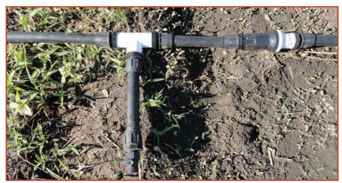
Figure 6. High pressure (50 psi) is maintained to distribute water with a pressure regulator (right) installed at the beginning of the header pipe. A garden hose thread connector at the end of the "T" allows for watering and overhead irrigation.

A typical small-acreage fruit or vegetable farm (1 to 5 acres) can use a small, motorized pump that moves approximately 50 gpm at 75 to 80 psi (Figure 8A). For very small-acreage growers with less than 1 acre, it is important not to use a pump that is too large or incapable of maintaining water movement