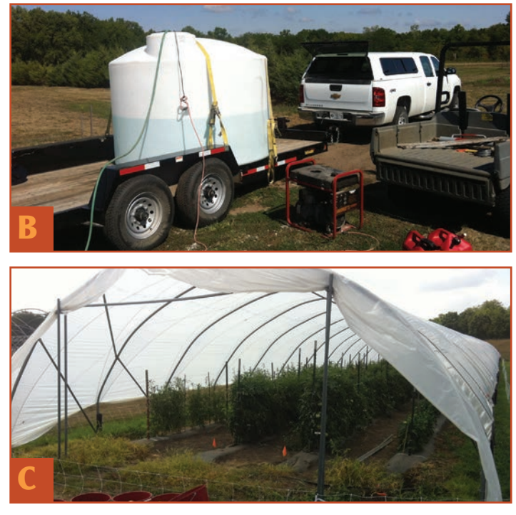
Figure 14. (A) A roll of drip tape includes details for calculating water use and determining system pressure requirements. (B) Tank watering is possible because of the low water volume required by the drip system. A small electric pump is placed into the tank and powered by a generator. (C) Low-pressure drip tape and plastic mulch help maintain consistent soil moisture for high-tunnel tomatoes and peppers.

Cary Rivard, Ph.D., Fruit and Vegetable Specialist and Director K-State Research and Extension Center for Horticultural Crops at Olathe Cathie Lavis, Ph.D., Landscape Specialist Department of Horticulture, Forestry and Recreation Resources