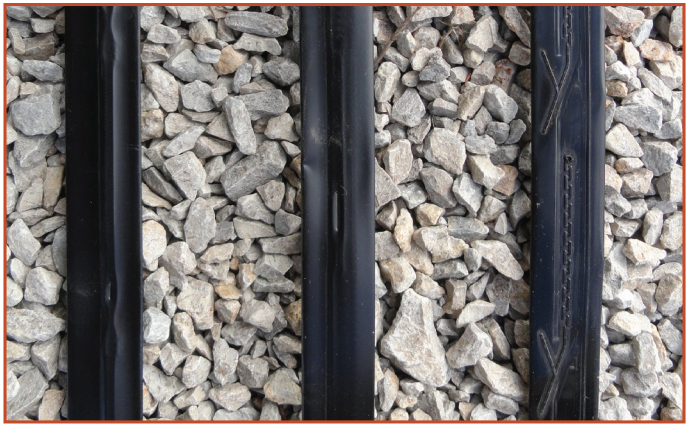
Figure 4. Drip tape is used in low-pressure drip systems. Preinstalled emitters are available with various spacings.

Low-pressure drip systems are the type most commonly used for annual vegetable production. Components are inexpensive and simple to set up and tear down during the growing season. Lowpressure systems use drip tape, or T-tape, which has emitters installed at various spacings (4, 12, and 18 inches) along the drip line (Figure 4).