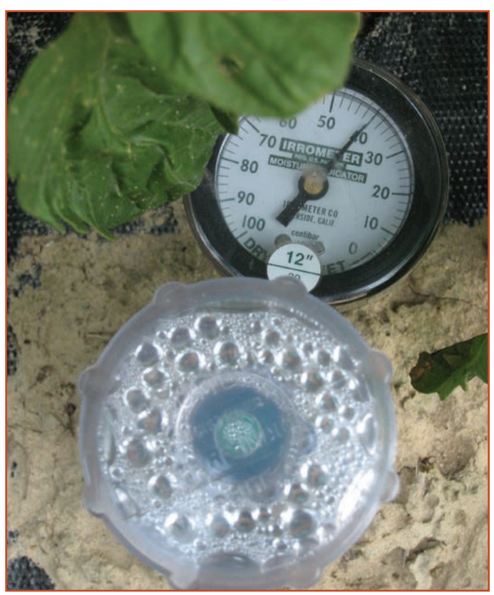
Figure 13. A tensiometer can be used to monitor soil moisture. feet). In this case, the tape uses 8 gpm to run the irrigation system:

Total water volume usage can be calculated using the total row length of drip tape/tubing, the emitter spacing and gpm of each. Water usage is specific to the drip tape and is provided by the manufacturer (Figure 14A). The following example shows how to determine the amount of water required to irrigate a 24- by 200-foot high tunnel with four rows of drip tape (800 feet total) for 2 hours (Figure 14C). It assumes emitters are spaced every 4 inches, using 60 gph per 100 feet of tape (equal to 1 gpm per 100