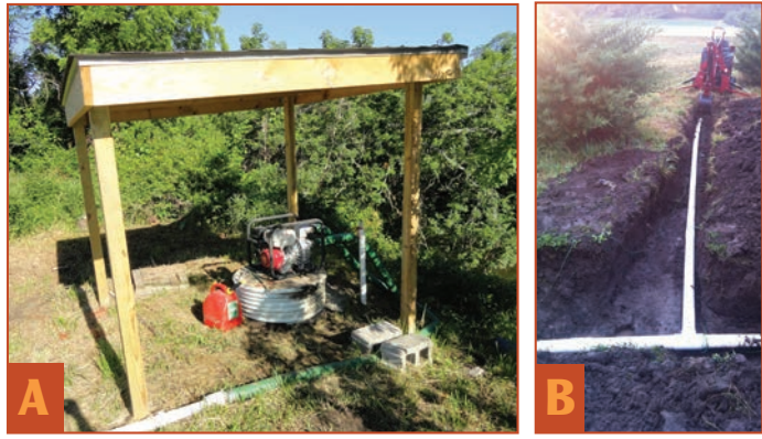
Figure 8. (A) A gas-powered 10 hp pump is covered to reduce wear from environmental damage and keep the engine cool during operation. (B) Belowground 3-inch PVC piping distributes water to various production fields.

due to the low volume. Water will need to be distributed throughout the farm acreage. This can be done using underground PVC piping (Figure 8B) or with lay-flat hoses for aboveground water transport. For help selecting proper pumps, consult a dealer who specializes in these products.