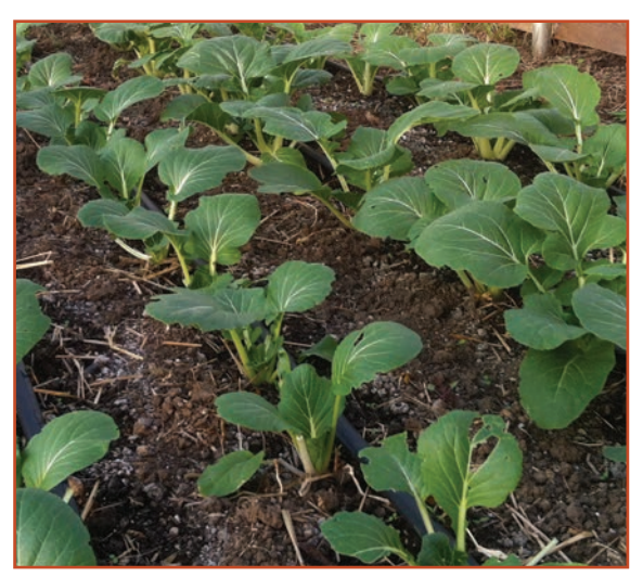
Figure 1 . Drip tape running beside pak choi provides water directly to the root zone.

With an understanding of basic drip irrigation system requirements, installation and use is fairly simple. Drip irrigation systems fall into two main categories: high pressure or low pressure. In