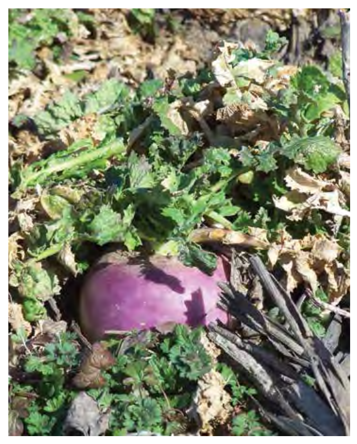
Turnip growing in residue.

plant, the lower the nitrate concentration. If nitrate value is high early in the season, it may be suitable for grazing at a later date. Introduce animals to the brassica diet over 5 to 7 days. Do not turn out hungry animals. Make sure they are full of hay first.