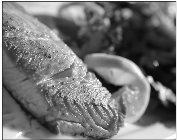
Oily fish, such as salmon, is a source of vitamin D.

Breastfeeding — Infant vitamin D requirements cannot typically be met