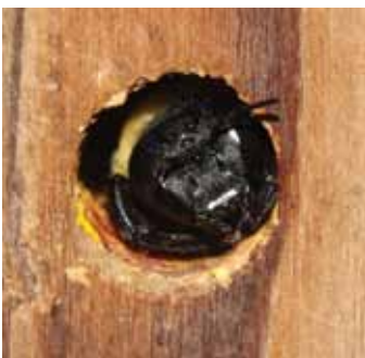
Figure 2: Female carpenter bee

Male carpenter bees are easily distinguished from females because they have a whitish or golden (some describe it as bald) face. Females have a dark or black shiny face (Figures 2 and 3). The distinction is important because females can sting, while males cannot.