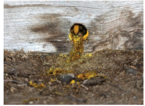
Figure 5: Carpenter bee tunnel entrance with sawdust and pollen trail

Begin insecticide treatment as soon as bees are noticed in the spring or when adults emerge in late summer. Treating at night results in the most effective control and avoids disturbing the bees.