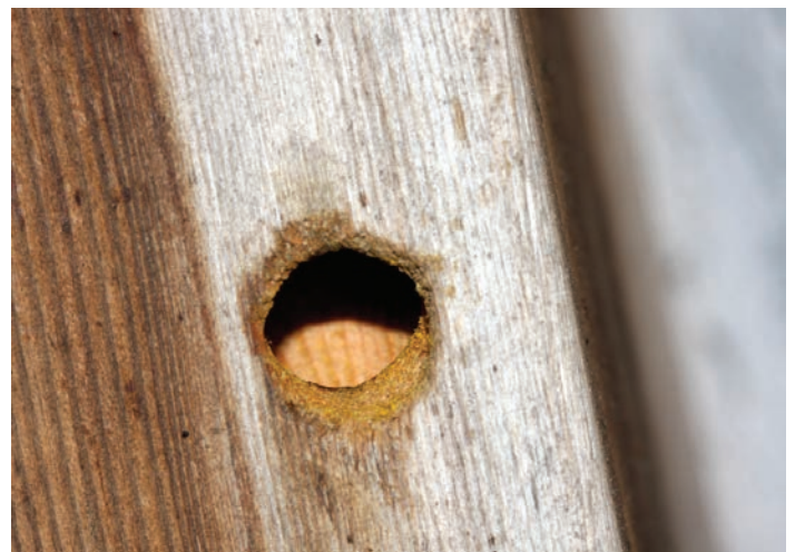
Figure 4: Carpenter bee tunnel entrance

After mating, females begin to construct nests by refurbishing old nest sites or excavating new sites. Carpenter bees' nests are relatively large, like the bees themselves. Excavation proceeds slowly, at the rate of about one inch per week in old, soft woods. The females chew through the wood, leaving \frac{1}{2} inch diameter tunnels that are smooth on the inside (Figure 4). They can chew through wood at right angles to the grain, but usually excavate the brood cells along the grain of the wood.