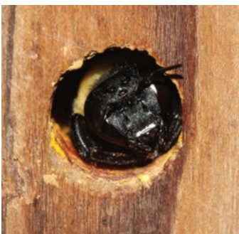
Figure 2: Female carpenter bee

Male carpenter bees are easily distinguished from females because they have a whitish or golden (some describe it as bald) face. Females have a dark or black shiny face (Figures 2 and 3). The distinction is important because females can sting, while males cannot.