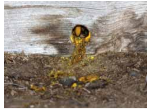
Figure 5: Carpenter bee tunnel entrance with sawdust and pollen trail

Begin insecticide treatment as soon as bees are noticed in the spring or when adults emerge in late summer. Treating at night results in the most effective control and avoids disturbing the bees.