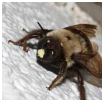
Figure 3: Male carpenter bee