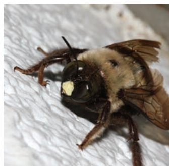
Figure 3: Male carpenter bee