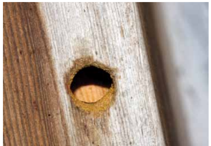
Figure 4: Carpenter bee tunnel entrance

After mating, females begin to construct nests by refurbishing old nest sites or excavating new sites. Carpenter bees' nests are relatively large, like the bees themselves. Excavation proceeds slowly, at the rate of about one inch per week in old, soft woods. The females chew through the wood, leaving 1/2 inch diameter tunnels that are smooth on the inside (Figure 4). They can chew through wood at right angles to the grain, but usually excavate the brood cells along the grain of the wood.