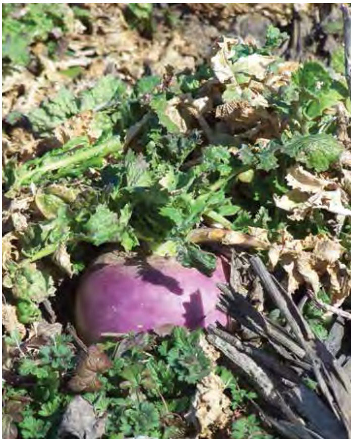
Turnip growing in residue.

plant, the lower the nitrate concentration. If nitrate value is high early in the season, it may be suitable for grazing at a later date. Introduce animals to the brassica diet over 5 to 7 days. Do not turn out hungry animals. Make sure they are full of hay first.