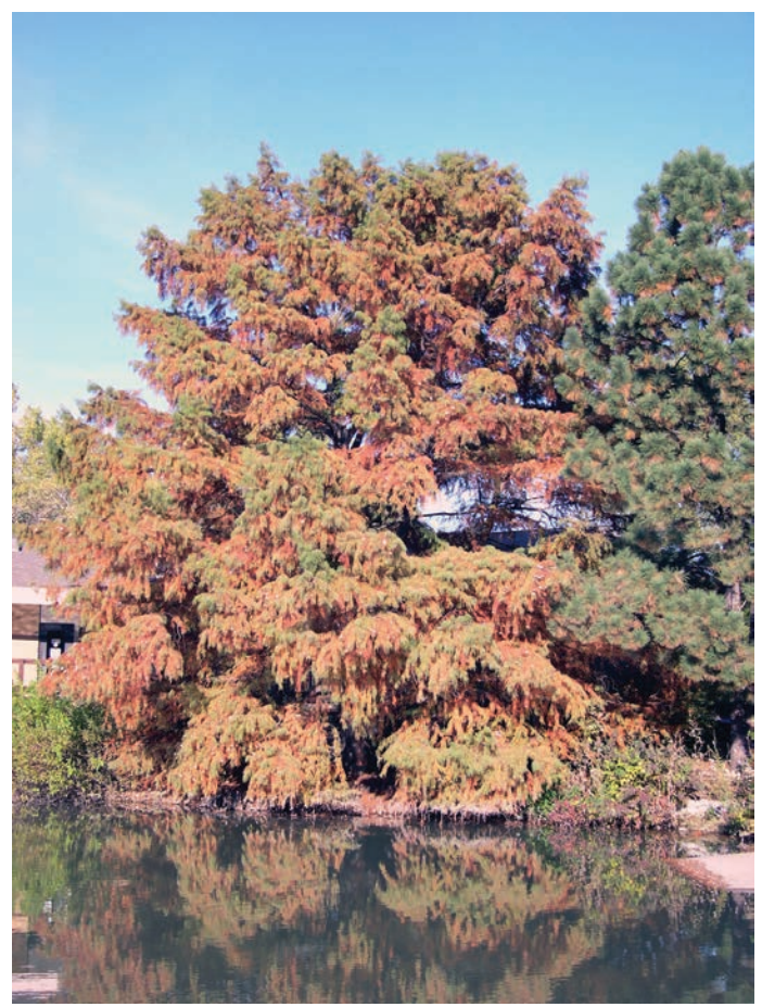
Dillon Nature Center, Hutchinson, Kansas

Pondcypress ( Taxodium distichum var. imbricarium ) – previously listed as a separate species ( T. ascendens ) this variety is similar to Baldcypress except that the deciduous branchlets have an upright, or erect, habit. Overall Pondcypress is more upright and narrow than Baldcypress.