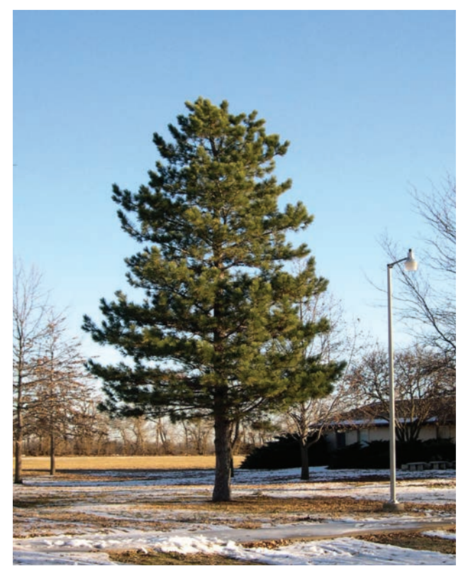
Belle Plaine, Kansas

'Arnold Sentinel' – an upright columnar form from the Arnold Arboretum