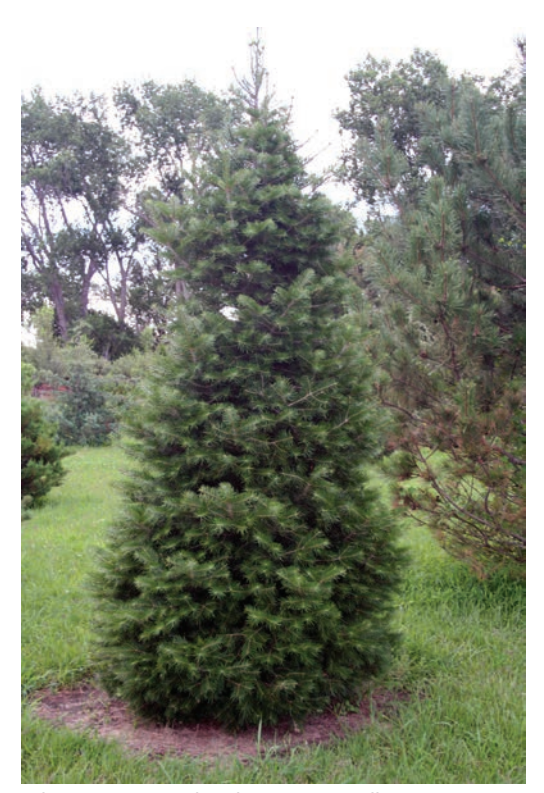
John C. Pair Horticultural Center, Haysville, Kansas

Dwarf and weeping white fir selections are popular among conifer collectors. Selections have been made for improved blue foliage color. In Kansas, most of the white fir originated from seedlings, not cultivars.