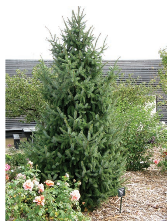
Johnson County Extension Office, Olathe, Kansas

Several dwarf ornamentals to choose from.