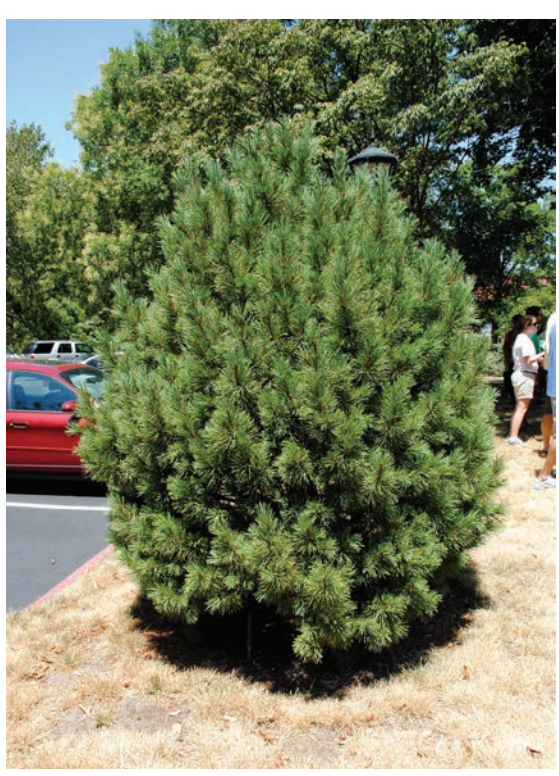
Kansas City, Kansas