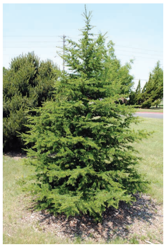
Sedgwick County Extension Education Center, Kansas

Numerous cultivar selections are available, many for improved blue color of the needles. Some variegated forms are not as vigorous as the species. Many selections for weeping, and at least one columnar (fastigiate) form.