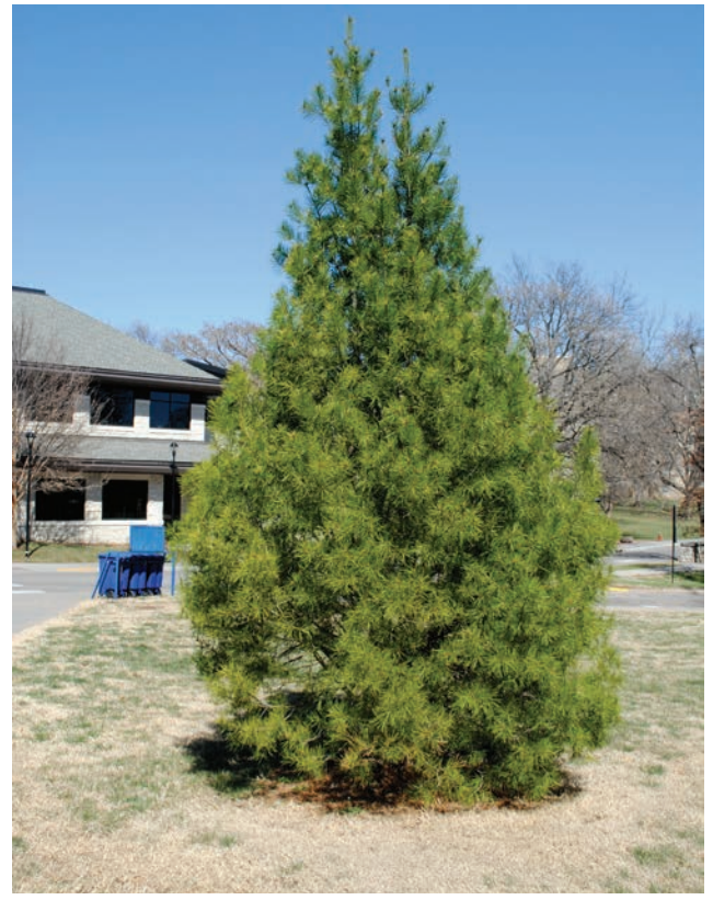
Kansas State University, Manhattan, Kansas

'Rowe Arboretum' - selected for its more uniform and compact growth.