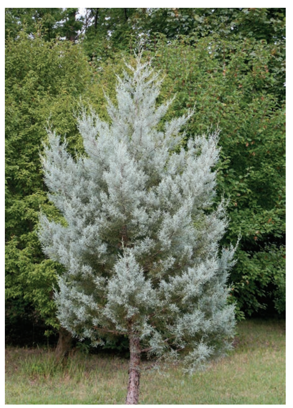
John C. Pair Horticultural Center, Haysville, Kansas

Cookes Peak – a seed strain collected from Cookes Peak, New Mexico. Nice blue foliage with improved cold hardiness. This is not a true clonal cultivar because plants originate from seed. Probably the best choice for Kansas.