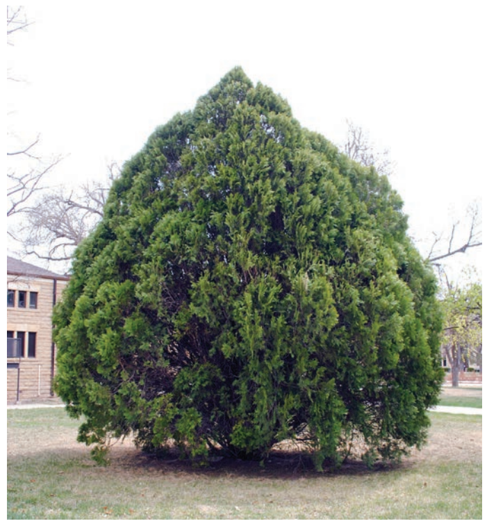
Fort Hays State University, Kansas

'Berckman's Gold' – a dense, compact form that will eventually reach a height of 10 feet. Golden to light-yellow green foliage. Some other dwarf or variegated cultivars exist, but they are not applicable for this publication.