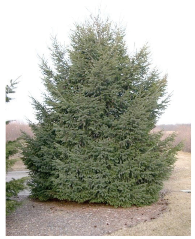
Nebraska City, Nebraska