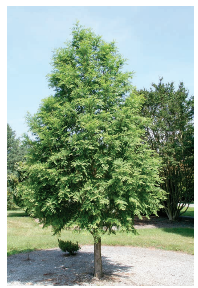
U.S. National Arboretum, Washington, D.C.

Of the few cultivars available, 'Ogon' is the only one that has generated interest in the nursery industry. It is a variegated selection that probably would not succeed in Kansas. A new selection from the Missouri Botanical Garden called 'Raven' has been selected for its superior formal growth habit.