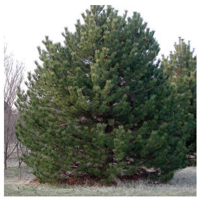
John C. Pair Horticultural Center, Haysville, Kansas

Many dwarfs, uprights, and weepers, however, none of significance for Kansas.