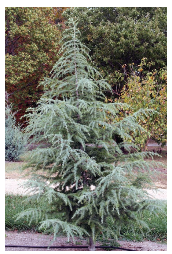
John C. Pair Horticultural Center, Haysville, Kansas

Several cultivars exist. Many valued for improved form or improved 'blue' color of the needles. Some selections are recommended for improved cold hardiness. 'Karl Fuchs' is noted for improved hardiness, which has proven true in Kansas trials thus far. A long-term field test will determine whether this cultivar is truly hardy.