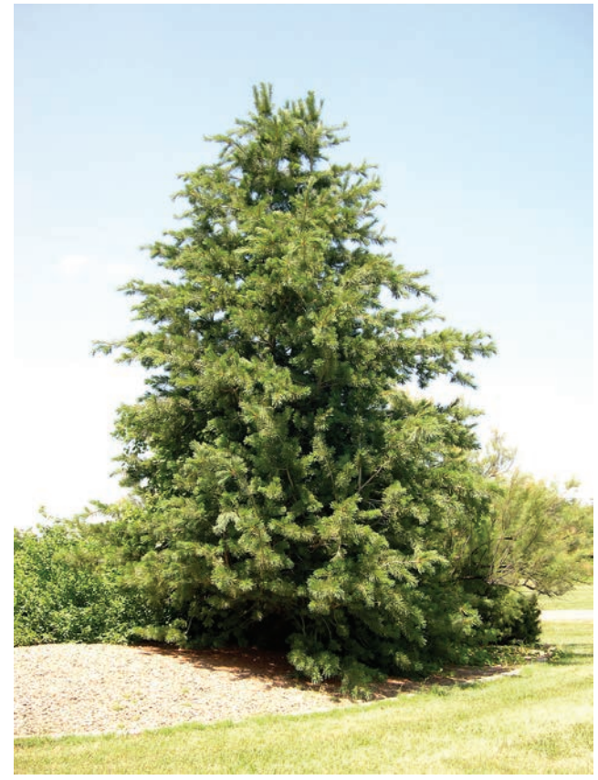
Overland Park Arboretum, Overland, Kansas