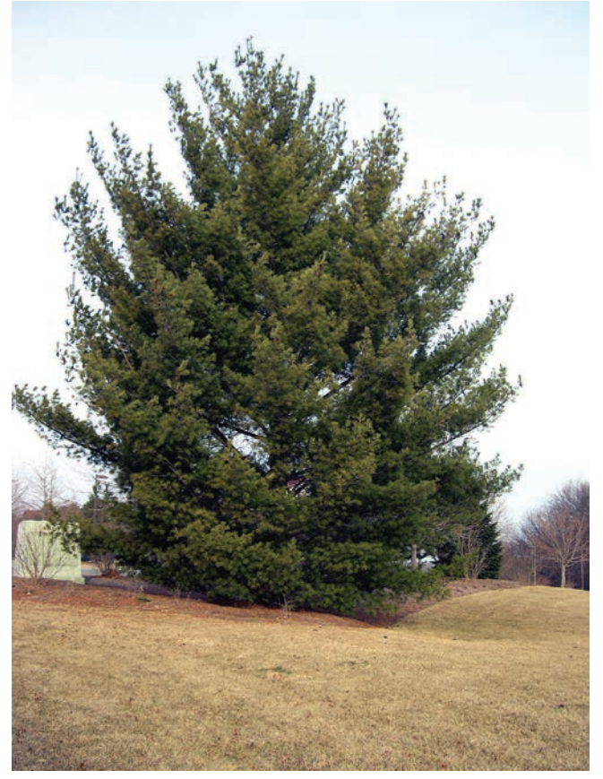
Nebraska City, Nebraska

Many dwarf, weeping, and contorted cultivars are available, but few are applicable here.