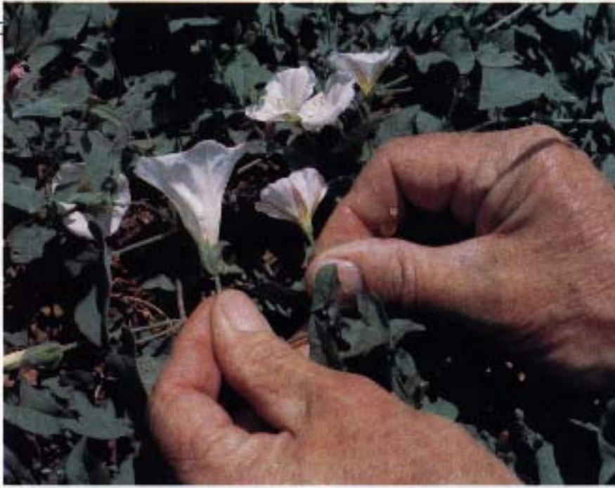
Field bindweed looks similar to the less-destructive hedge bindweed. The flower of the hedge bindweed, left, is much larger than the field bindweed flower.

bindweed should be avoided, if possible. Livestock fed contaminated grain or hay should be confined, or restricted to areas already infested, until the bindweed seed passes through the animals. Manure containing field bindweed should be spread only on bindweed-infested land. Harvesting, tillage, and other machinery should be thoroughly cleaned before moving from infested to non-infested fields. New infestations that start in waterways, roadside ditches, shelter belts, fence rows, and along railroad rights-of-way should be controlled immediately.