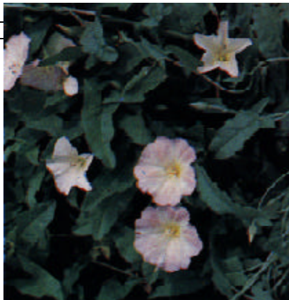
Flower color and leaf shape may vary on the same plant.

Variable response of field bindweed to herbicides is common and may be related to plant age, biotype, and environmental conditions. Leaf cuticles are fully formed soon after the leaf attains maximum size, but the cuticle cracks and the wax content of the cuticle gradually decreases with age through exposure to wind, rainfall, and scarification by wind-blown sand and dust. Thus, herbicide uptake may be greater in older plants that are actively growing than in younger plants. Plants growing under moisture or heat stress and exposed to full sunlight usually have smaller leaves with more cuticular wax and slower biological processes than shaded plants and plants growing in favorable conditions. As plant stress increases, herbicide uptake and translocation usually decrease. Consequently most herbicides control field bindweed less