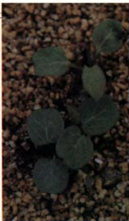
The rounded leaves of the seedlings, left, give way to arrowhead-shaped leaves a few days after emergence. Leaf shape may vary, even on the same plant.

Seed of field bindweed will germinate near the soil surface throughout the growing season following rainfall, with most germination occurring in