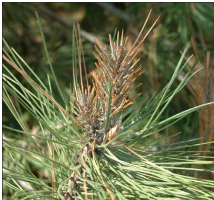
Figure 1. Newly emerging (current-year) shoots are susceptible to tip blight. The shoots are stunted, and the needles are stunted and brown.

Tip blight is a fungal disease that affects Austrian, ponderosa, Scots, and mugo pines. The disease is most severe on mature trees (20 years or older). Repeated infections over many years can kill large sections of trees or entire trees.