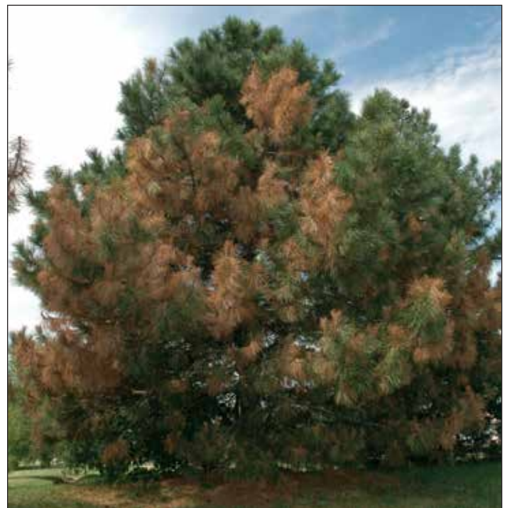
Figure 2. Severely infected trees can have tip blight throughout the crown. On some branches, the disease has progressed from the tips inward to older wood.

In late summer or fall, tiny black spore-producing structures (called pycnidia) are formed on the scales of