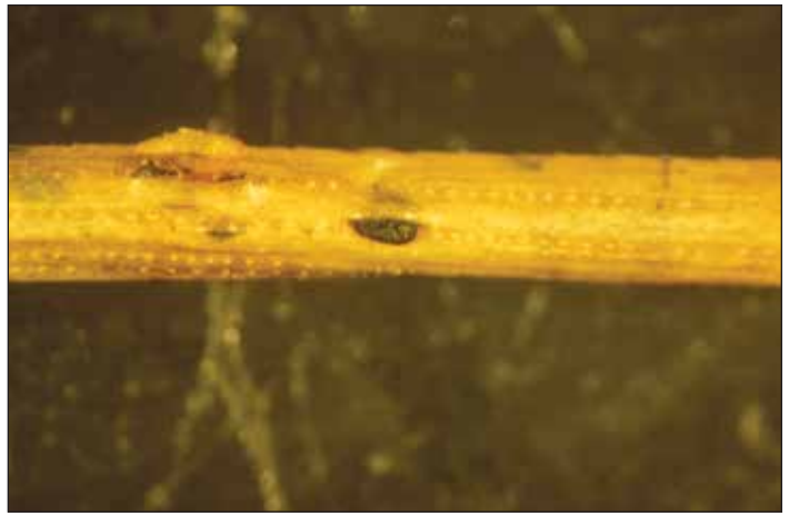
Figure 6. Dothistroma spore-producing structures rupture the needle surface in late winter or early spring.

Spores are dispersed in water droplets or aerosols during periods of rainfall from mid-May through October. Newly developed needles are resistant at first, but become