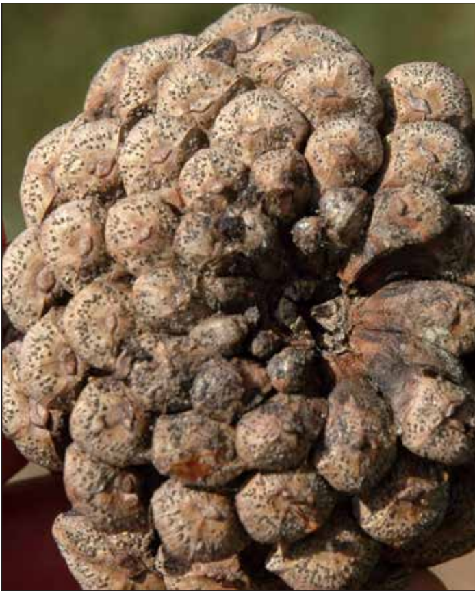
Figure 3. Black spore-producing structures of the tip blight fungus are visible on 2-year-old pine cone scales.

2-year-old cones — it looks like black pepper has been shaken onto the cones (Figure 3). The same black specks are also sometimes visible at the base of the infected needles later in the summer.