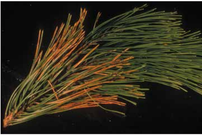
Figure 5. Dothistroma needle blight causes a partial-needle scorch (browning) on interior needles (1-, 2-, or 3-year-old needles).

drop (see below). However, a key indicator for Dothistroma is that the tip of the needle (beyond the red band) turns brown, but the base stays green for several months resulting in a partial needle scorch (Figures 4 and 5). The disease is usually most severe in the lower part of the tree on the interior parts (1-, 2-, or 3-year-old needles). The current needles sometimes show symptoms as well.