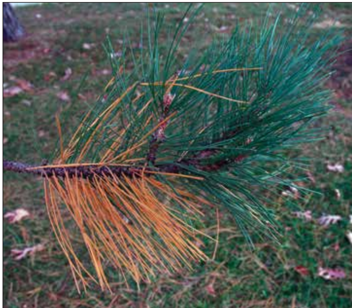
Figure 8. During natural needle drop, inner needles turn brown and are shed. Note that the needles are brown from tip to base. They do not have the partial-scorch of Dothistroma needle blight.

With natural needle drop the older, inner needles throughout the tree turn brown and shed in the fall (Figure 8). The shedding takes 2 to 3 months to complete. The appearance of the tree eventually improves as it produces new growth. Browning and dropping of the current-season growth is not natural needle drop.