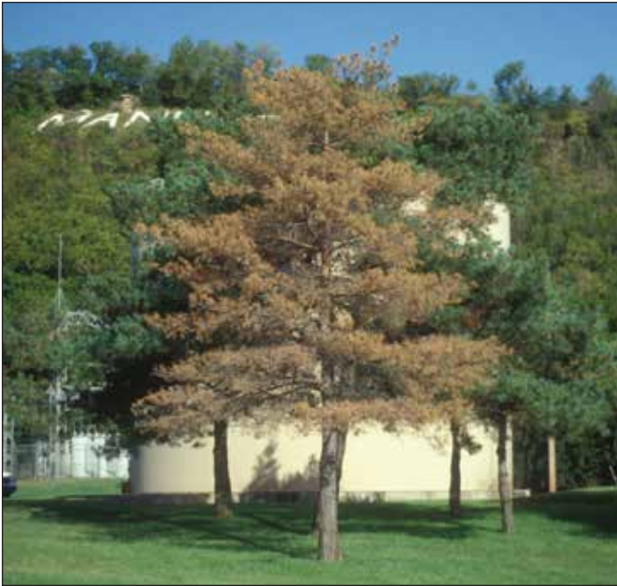
Figure 7. Pine wilt can kill an entire tree in weeks or months.

particular, increasing numbers of Austrian pines have been affected in recent years.