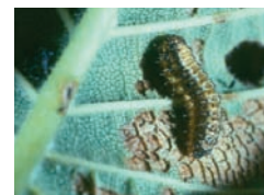
Figure 4. Larva

Pupae — Pupae are bright orange-yellow when newly formed. They turn dull yellow to yellow-brown as they develop (Figure 5).