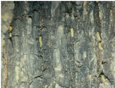
Figure 7. Beetles on tree trunk

Tree Banding — The effectiveness of tree banding relies on the habit of elm leaf beetle larvae crawling down a tree trunk to pupate on the soil or beneath soil litter at the base of the tree (Figure 7). A band of sticky material applied around the tree trunk traps the migrating larvae. Drawbacks to sticky bands are that they are sticky