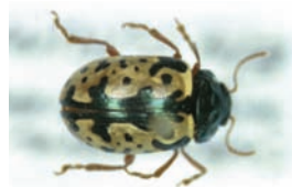
Figure 1. Calligrapha

Elm trees, noted for their shade, are attacked by two species of leaf beetles. Elm calligrapha beetles (Figure 1) occur sporadically, but can cause extensive defoliation. Elm leaf beetles ( Xanthogaleruca luteola ) are found throughout Kansas and are responsible for the undesirable browning of tree foliage during the summer.