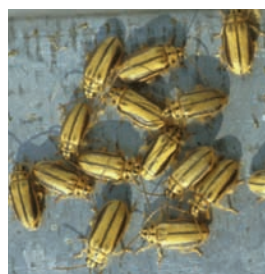
Figure 2. Elm leaf beetles

Adults — Adult elm leaf beetles are approximately ½-inch long. “New” adult beetles are yellowish with black, fairly broad stripes down the outer edges of their wing covers, and a thin stripe where edges of the wing covers meet when wings are folded over the body (Figure 2). Black spots are located at the base where wing covers meet the thorax, with additional marks on the thorax and head. As adult beetles age, the lines and markings become less distinct, blending into the overall body color and changing to a darker olive or gray.