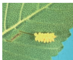
Figure 3. Eggs

Eggs — Clusters of five to 25 eggs laid in two to three parallel lines are generally found along veins on lower leaf surfaces. Eggs are bright yellow and somewhat pointed at their apical ends (Figure 3). Each female can deposit 400 to 800 eggs.