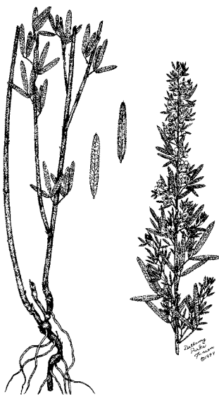
Figure 5. Slender lespedeza plant (left) showing the leaflet shape (center), lower stem and root system. (Drawing courtesy of Oklahoma State University).

Sericea lespedeza is a shrubby, deciduous perennial about 2 to 5 feet tall. Coarse stems are single or clustered with numerous branches. New growth each year comes from buds located on the stem bases or crown about 1 to 3 inches below ground. Stems and branches are densely leaved. Leaves are trifoliate and attached by short petioles. Leaves are club- or wedge-shaped (wider at the tip than the base), \frac{1}{4} to 1 inch long, and \frac{1}{16} to \frac{1}{4} inch wide. The leaf is round to flat at the top, with a conspicuous point at the tip. The lower leaf surface has silky hairs. Scale-like stipules are present on the stem.