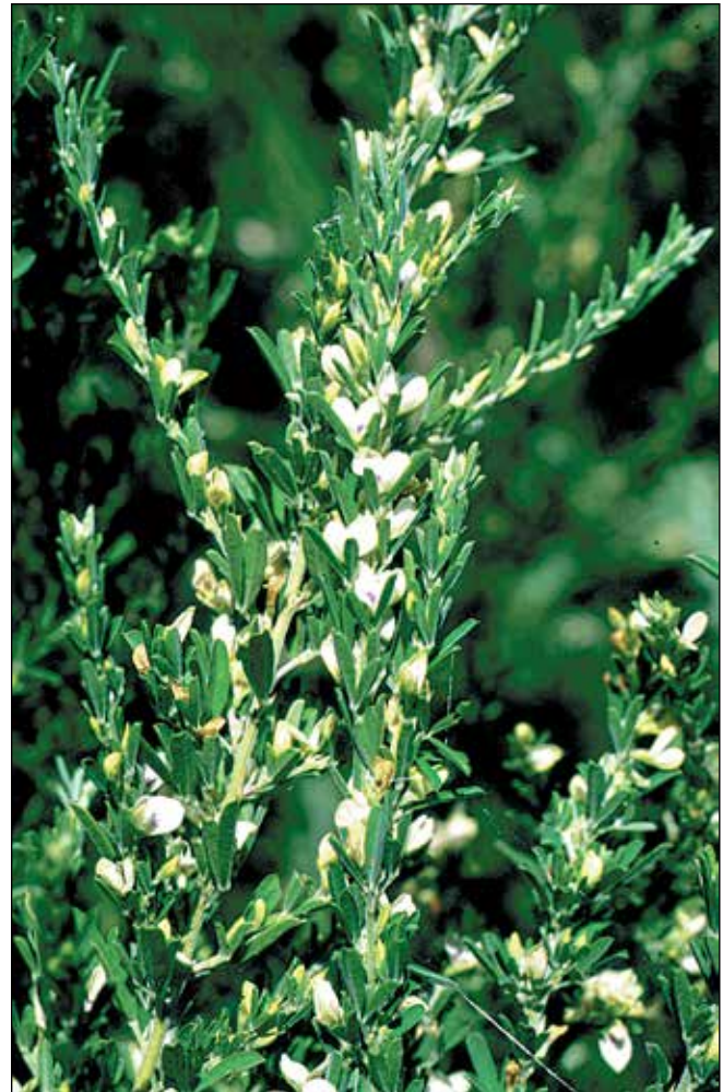
Figure 3. The flowers of sericea lespedeza are borne in the axils of the leaves.

Oklahoma. Sericea lespedeza has been found growing in all parts of Oklahoma, except the Panhandle. Sericea uses water less efficiently than many other warm season plants and does best when annual precipitation is 30 inches or more, which explains why it is a greater problem in eastern Oklahoma. However, sericea has been reported on Conservation Reserve Program (CRP) lands and rangelands in western Oklahoma.