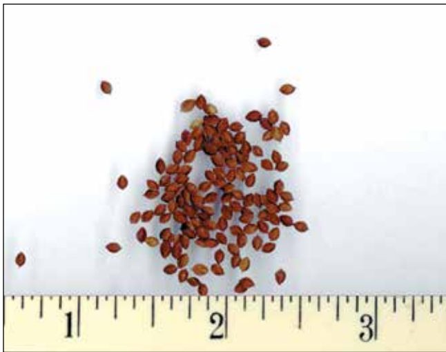
Figure 4. The seed of sericea lespedeza is small.