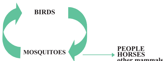
Figure 1. Transmission cycle of West Nile virus

Bird-to-bird transmission is possible because predatory birds feeding on infected birds can become infected. Migratory birds and the movement of goods contaminated with mosquitoes are