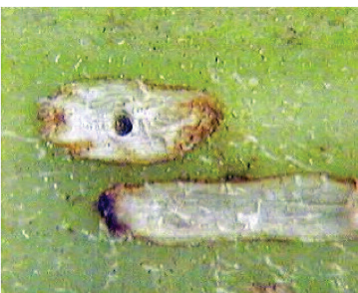
Figure 2. Adult feeding scar and ovipuncture on sunflower petiole

Adult beetles are gray to bluish-gray and \frac{3}{8} to \frac{3}{4} inches (1.0 to 2.0 cm) long (Figure 1). Antennae have dark, transverse bands and are longer than the body. Adult beetles are active during the day but secretive, spending much of the time hiding under leaves within the plant canopy. Sometimes they may be seen flying and running around on plant surfaces. When approached, beetles either take flight or fall to the ground, feigning death.