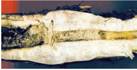
Figure 9. Mature dectes larva in confection sunflower showing limit of girdling radius

Another advantage of large plants is slower stalk desiccation postmaturity, which may extend the period of larval feeding and delay girdling. In oil sunflowers, yield per