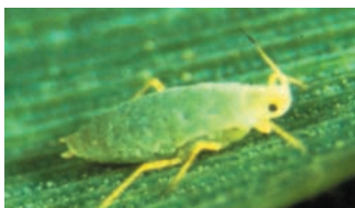
Figure 2. Russian wheat aphid

The Russian wheat aphid is a small, lime-green aphid with a distinctive football-shaped body (Figure 2). The legs, antennae and cornicles are short compared to most other aphids. Viewed from the side, the terminal segment of the abdomen has a supracaudal structure that looks like a double tail. The greenbug is similar in color (Figure 3), but the dark green stripe, long antennae and cornicles, which are often longer than the body, make it easy to distinguish from the Russian wheat aphid.