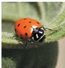
Figure 6. Convergent lady beetle

Predators and parasitoids that attack other grain aphids also feed on the Russian wheat aphid, but not all are effective at reaching them in rolled leaves. Exclusion cage studies in western Kansas indicate that the convergent lady beetle, Hippodamia convergens (Figure 6), also the key predator of greenbug in the region, is one of the most important natural controls. The seven-spotted lady beetle, Coccinella septempunctata , is common in wheat fields in early spring and may play a role in reducing Russian wheat aphid numbers. Similarly, Aphidiid wasps, including the greenbug parasitoid Lysiphlebus testaceipes (Figure 7) also attacks and develops on the Russian wheat aphid.