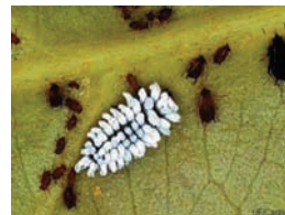
Figure 11. Scymnus beetle larva among aphids