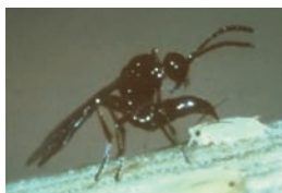
Figure 7. Aphidiid wasp

Wasps in the genus Praon belong to the same family but form distinctive mummies