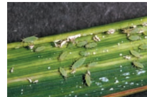
Figure 4. Leaf unrolled to expose Russian wheat aphids

Russian wheat aphids prefer to feed in rolled leaves on the upper parts of the plant (Figure 4). Greenbugs typically are found on the undersides of lower leaves and do not cause leaf rolling. Damage to wheat plants is noticeable from a distance. Besides rolled leaves and trapped heads, Russian wheat aphid feeding causes purple or white longitudinal streaking on the leaves (Figure 5). Leaves damaged by greenbugs turn brown and appear scorched. When searching for the Russian wheat aphid in wheat, it is often useful to look for damage first then for the aphids.