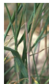
Figure 5. Purpling and rolling of leaves