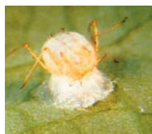
Figure 8. Mummified aphid ( Praon sp.)

with a pedestal-like structure (Figure 8). Other smaller predators and parasitoids that normally have little effect on greenbug populations have found Russian wheat aphid colonies in rolled leaves are