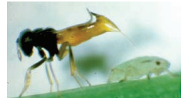
Figure 12. Aphelinid wasp ( Aphelinus spp.)

an ideal foraging environment because their own risk of predation and parasitism is reduced. Several of these are shown above. Clockwise, from left they include small hover flies ( Diptera: Syrphidae ) (Figure 9). Small ladybeetle species in the genus Scymnus have larvae with distinctive waxy filaments and can also be found feeding in Russian wheat aphid colonies (Figures 10 and 11). The introduced parasitic wasp Aphelinus albipodus ( Hymenoptera: Aphelinidae ) and other native Aphelinus spp. are small and stealthy and forage effectively in rolled leaves (Figure 12).