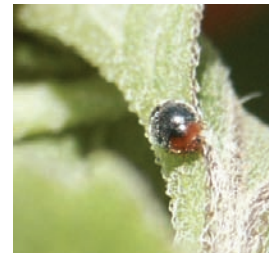
Figure 10. Scymnus beetle