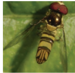
Figure 9. Hover fly