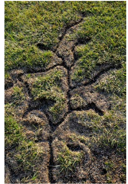
Figure 2. Surface runway system of the prairie vole