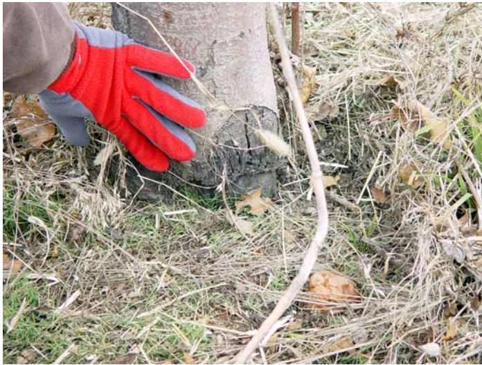
Figure 3. Voles may damage woody plants at or below ground level.

Voles eat a variety of plants, such as grasses, legumes, and crops (corn, soybeans, alfalfa, apples, wheat, potatoes, and other vegetables). In horticultural plantings such as flower and shrub plantings, orchards, and lawn and gardens, voles can cause damage by eating flower bulbs, clipping grass stems, girdling stems of woody plants, and gnawing roots. In late summer and fall, voles often store seeds, tubers, bulbs, and rhizomes. In the winter they may gnaw on stems and bark, causing significant damage to ornamental and orchard plantings (Figure 3). Plants not directly killed may be more susceptible to diseases or die from drought stress.