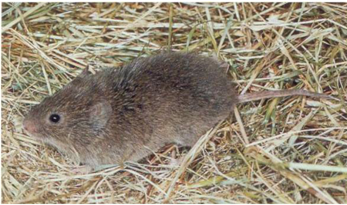
Figure 1. Prairie vole

Three species of voles occur in the state: woodland vole ( Microtus pinetorum ), meadow vole ( Microtus pennsylvanicus ), and prairie vole ( Microtus ochrogaster ) (Figure 1). Voles are small, weighing 1 to 2 ounces as adults. Overall body length varies from 3 to 5½ inches for the woodland vole, to about 4½ to 7 inches for meadow and prairie voles.